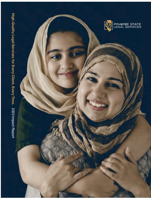
High-Quality Legal Services for Every Client. Every Time. 2023 Impact Report