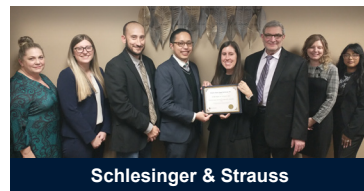
Schlesinger & Strauss